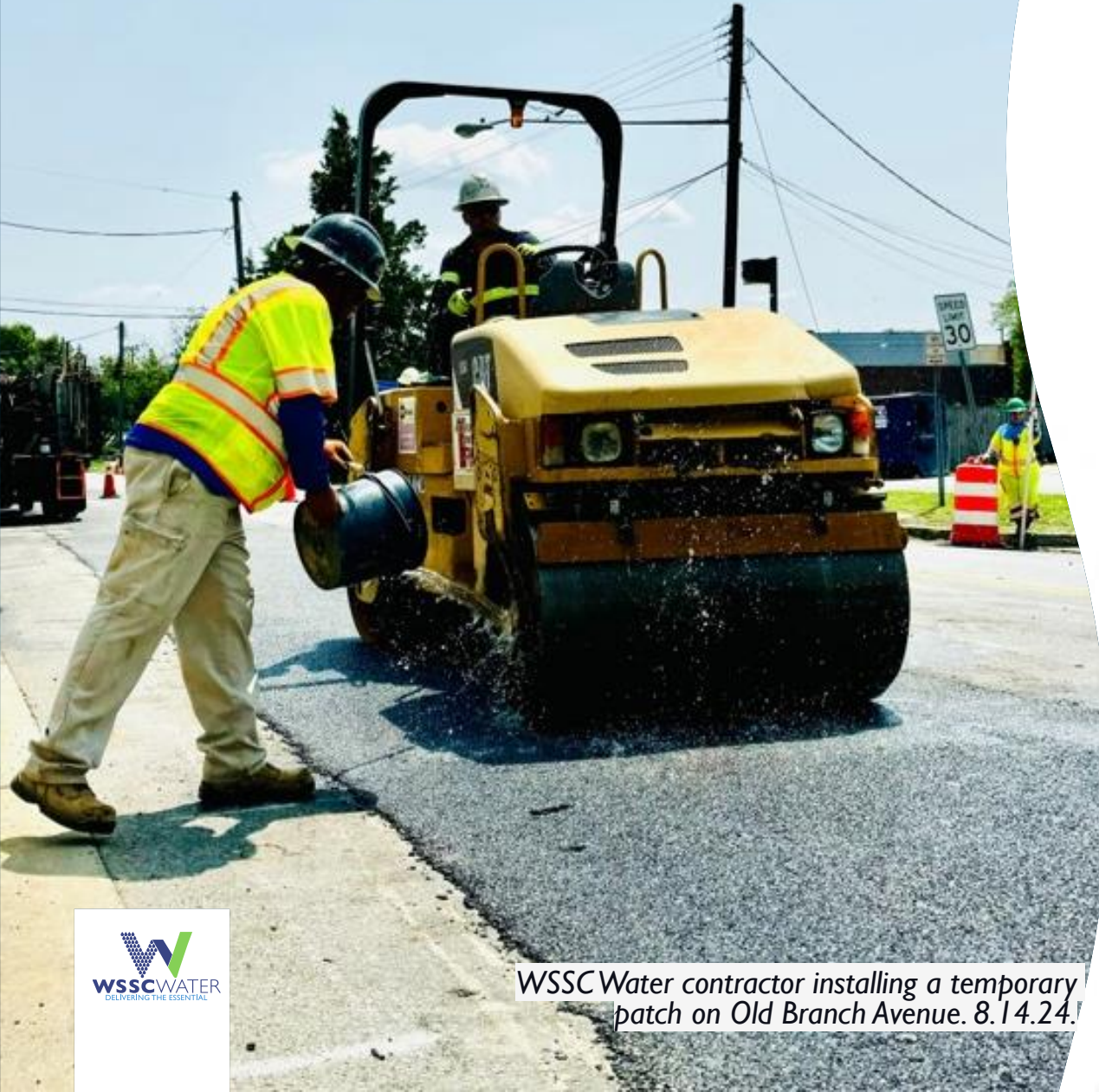
WSSC Water contractor installing a temporary patch on Old Branch Avenue. 8.14.24.